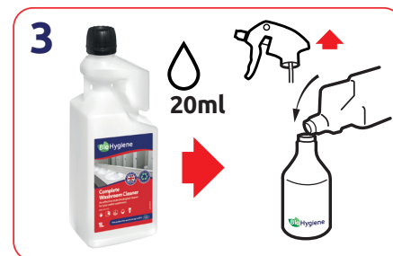
Dilute 20ml of product into a trigger spray. 1x1L Makes 50 triggers.