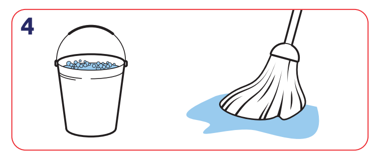
Mop surface. No need to rinse.