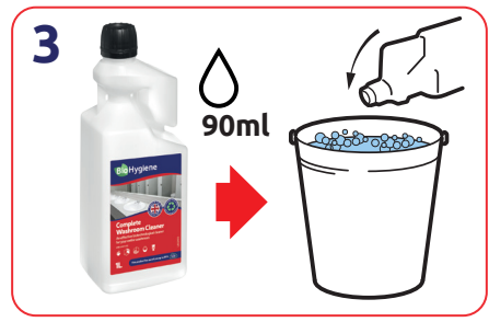
Dilute 90ml of product into a bucket. 1x1L makes 11 buckets.