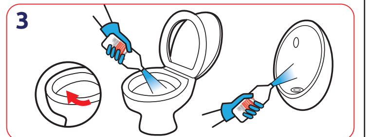
Flush, lower the waterline then apply product liberally, agitate with brush if necessary. Leave product in the toilet bowl.

Always use with cold water. Hot water will kill biological actives.