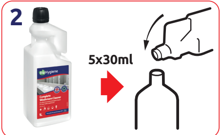
Dilute 150ml of product into refill bottle.