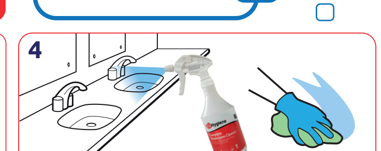
Spray and wipe with a cloth.